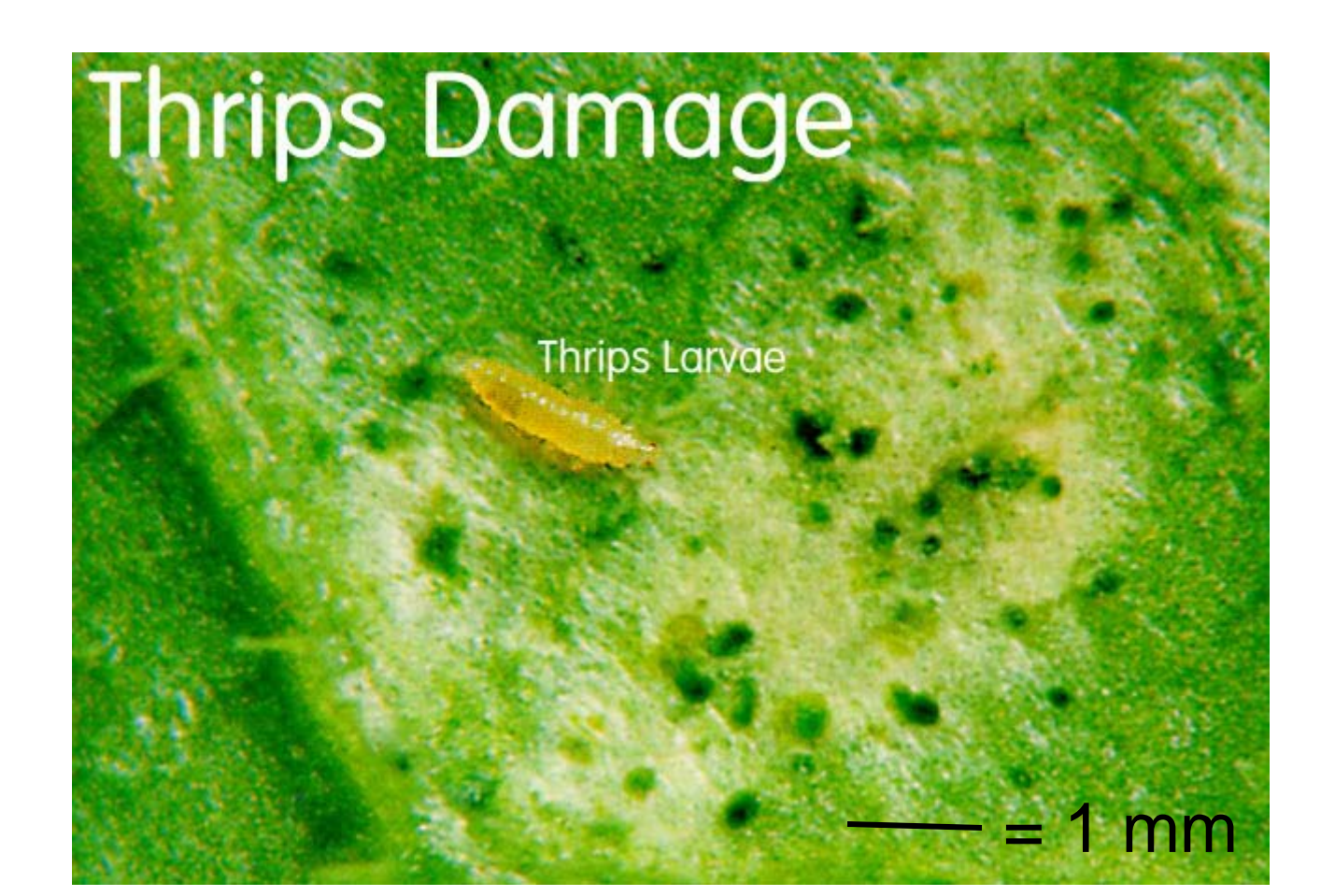
Feeding results in silvery or dark specks on leaf, adults winged, biocontrols available but slow acting